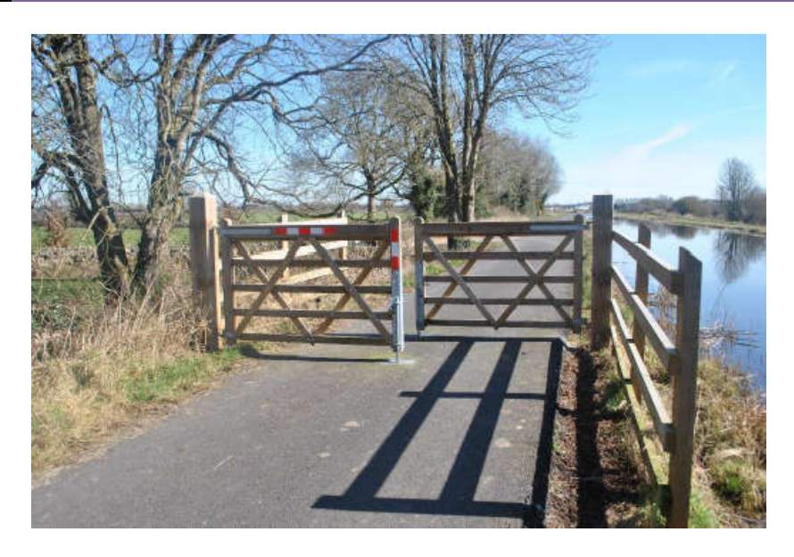
Access Control / Gates on the Offaly section of Greenway

Signage will be erected at the appropriate juntions and interfaces along the proposed route as identified on the scheme drawings. A post construction health and safety audit will identify the exact signage requirements and will be conducted prior to the route being fully operational. Additional safety measures to ensure the safety of users may be installed particularly on areas of shared surface and road crossings.