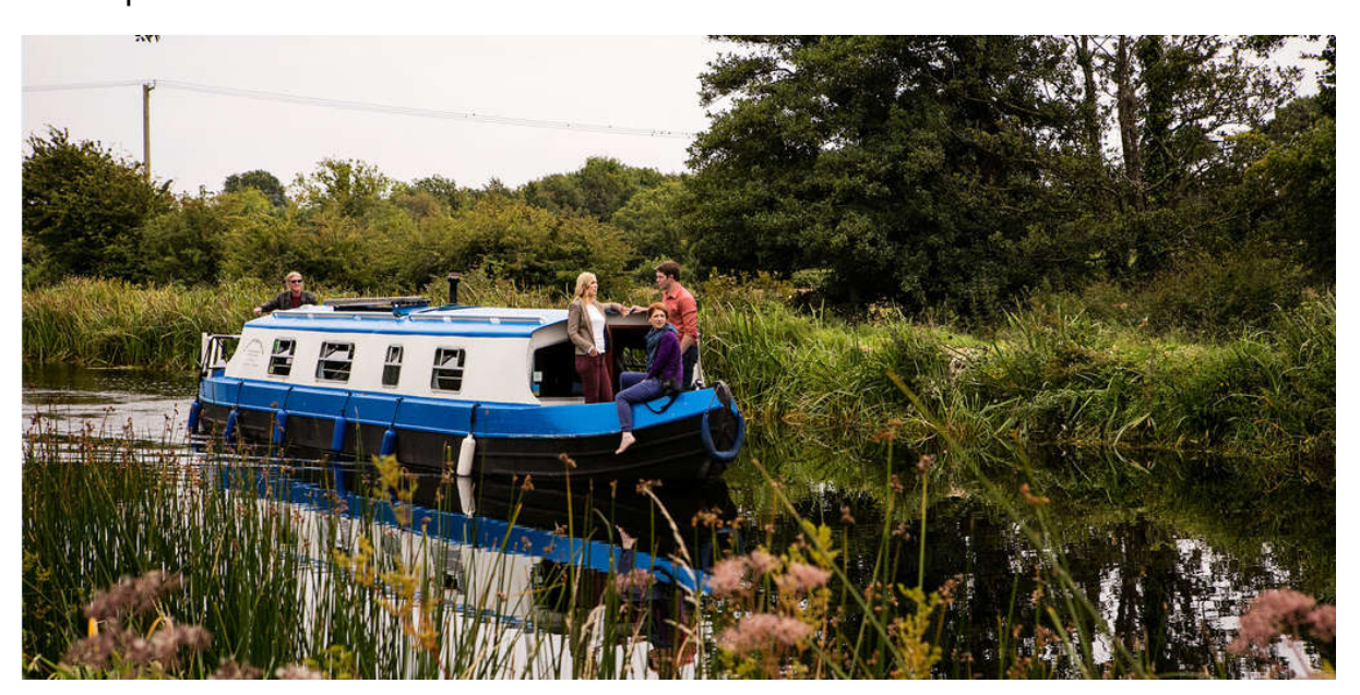
Barge on the Grand Canal

This Part 8 proposal has been specifically progressed in consultation with Waterways Ireland, National Parks and Wildlife Service and the Department of Tourism, Transport and Sport to meet the objectivies of the Regional Planning Guidelines for the Greater Dublin Area 2010 – 2022 and the Kildare County Development Plan 2017 – 2023.