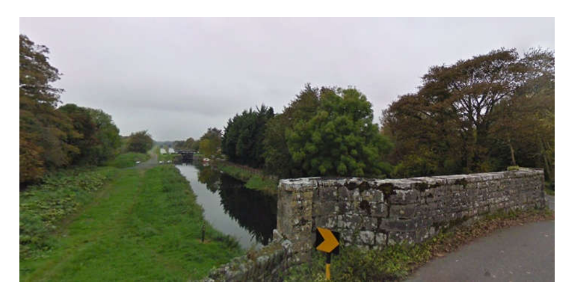
Grass towpath at Devonsire Bridge

Ponsonby Bridge to Devonsire Bridge ; The Greenway remains on the south bank, and will see the existing grass towpath upgraded to a compacted stone and dust surface.