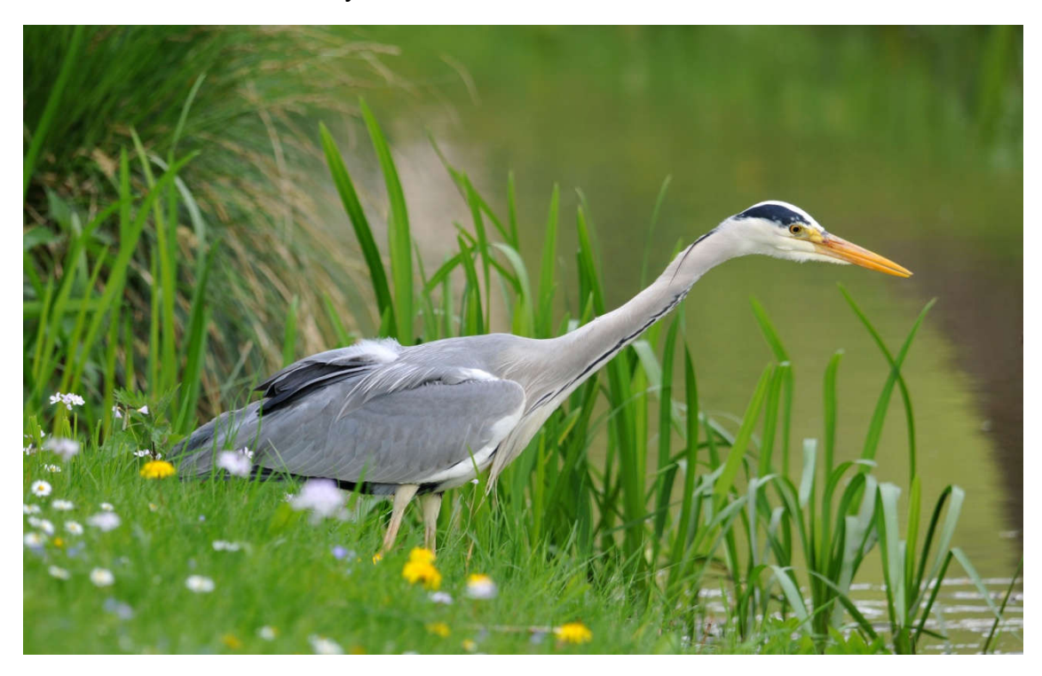
Heron fishing the Canal Bank

An Ecological Cumulative Impact Assessment ECIA, commissioned by Waterways Ireland was undertaken by Roughan O' Donavan and published in March 2016. The ECIA includes an ecological survey of the full corridor of the Grand Canal inclusive of the section location in County Kildare.