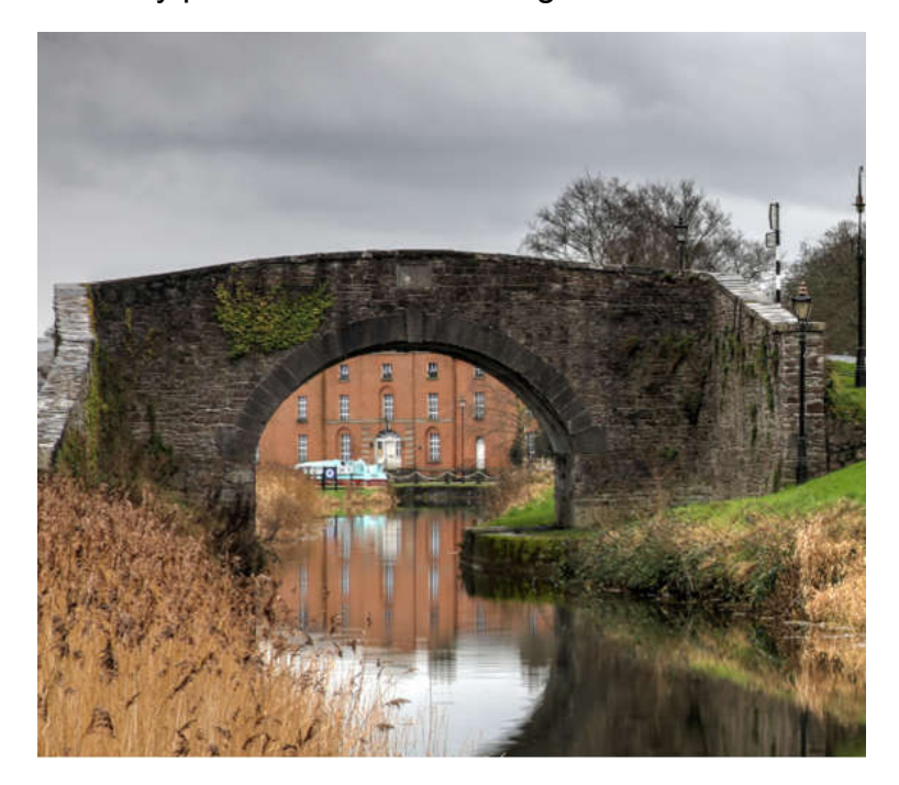
Binn Bridge - Disused Canal Hotel Robertstown Village

Bonynge Bridge to Robertstown ; West of Bonynge Bridge a new bridge is proposed to take the Greenway back to the southern bank and the existing grass towpath which will be upgraded to a compacted stone and dust surface. It was considered vital, during the route selection process that the Greenway arrive in Roberstown on the southern bank. This ensures that users of amenity are directed into the Village. This represents a unique opportunity for Robertstown, as the village is located on the midway point of the route through Kildare.